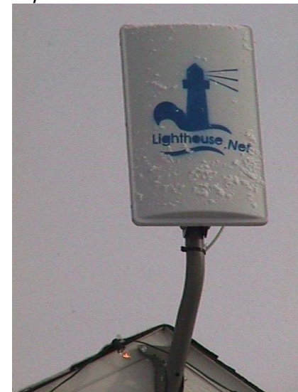
Mounting will vary by location and building type.